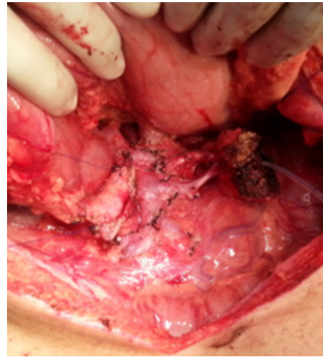
Figure 4. 25 years lady with a tumor over the body of her pancreas underwent Central Pancreatectomy