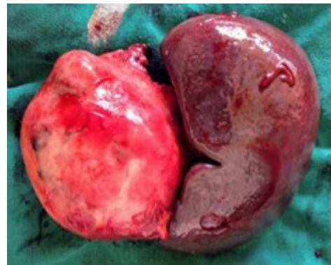
Figure 5. 15 years girl with a tumor over the tail of the pancreas underwent Distal Pancreatospfenectomy

have an excellent prognosis. 7,10 Regarding the choice of surgical procedure, function-preserving surgery has also been advocated in recent times. 11 Parenchyma preserving surgery might result in comparable oncological outcomes with better long-term functional outcomes as compared to conventional surgeries, especially for small SPNs. 11 Some argue for an increased chance of margin positivity with an increased risk of recurrence following function-preserving surgery. 5 Various published reports have demonstrated excellent 10-year disease-free survival rates more than 95% following surgical resection. 12,13 We had one death following CP done for pancreatic body SPN in this series, and the case was operated on in 2009. However, with better perioperative care and improved surgical techniques, perioperative complications have decreased and the remaining 14 patients are doing well.