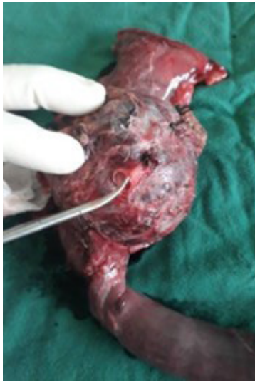
Figure 2. 22-year lady with SPN over the head of the pancreas - underwent Pancreaticoduodenectomy with venous reconstruction