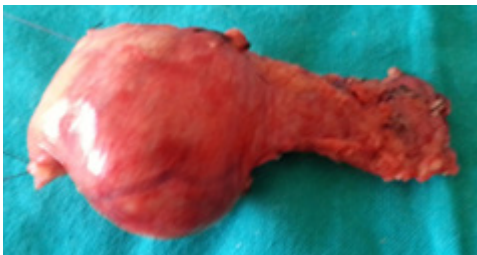
Figure 3. 29 years lady with tumor over the body of pancreas - underwent Spleen preserving Distal Pancreatectomy