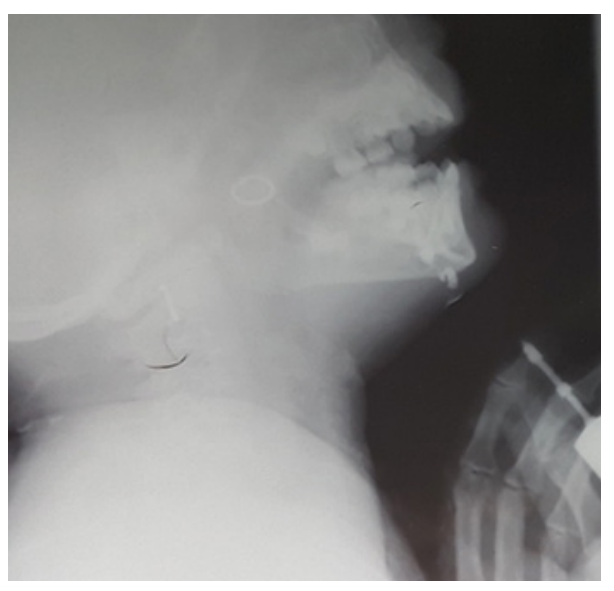
Figure 1. Sinogram of submental fistula

Since this opening was at very atypical site for the common anomalies such as branchial and thyroglossal fistula, fistulogram was planned to see the extent of the tract. It showed considerable sized tract extending from submental region to the floor of mouth (Figure 1). Excision of the tract was planned